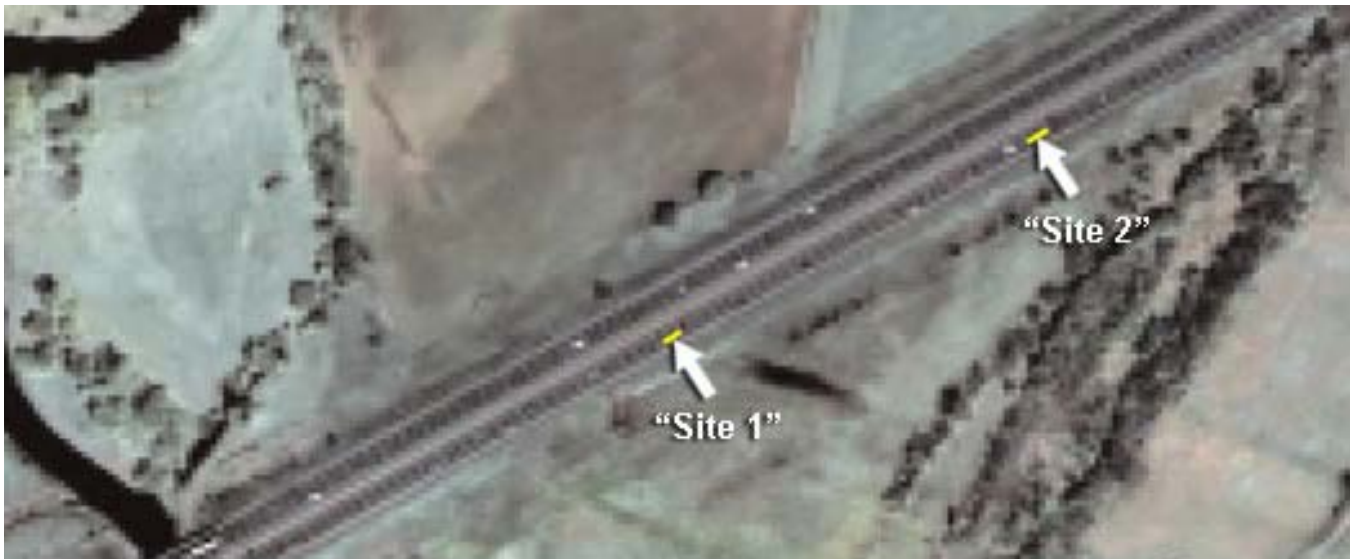
The location of sites mapped with the RoadMap system

RoadMap uses Noggin GPR systems to acquire precisely, geo-referenced GPR. Data are collected concurrently from multiple GPR sensors with differing frequencies and/or different path alignments. Synchronized video augments the GPR data, and all data are digitally recorded for later review and analysis.